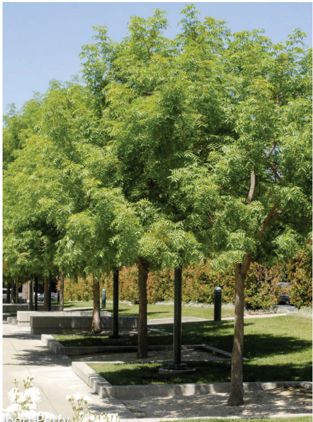
Building 5 Pistacia chinensis