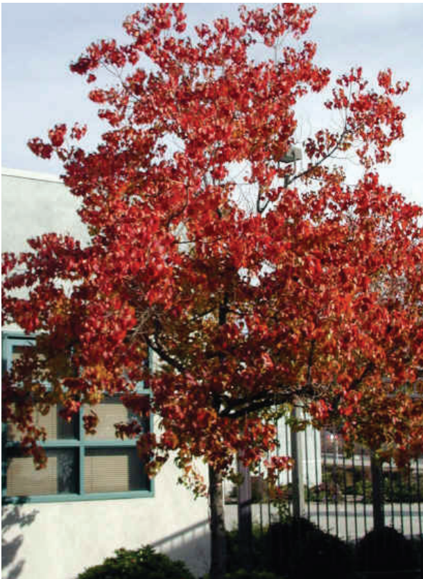
Building 6 Sapium sebiferum

© 2016 Site Image (NSW) Pty Ltd. ABN 44 801 262 380 as agent for Site Image NSW Partnership. All rights reserved. This drawing is copyright and shall not be reproduced or copied in any form or by any means (graphic, electronic or mechanical including photocopy) without the written permission of Site Image (NSW) Pty Ltd. Any license, expressed or implied, to use this document for any purpose what so ever is restricted to the terms of the written agreement between Site Image (NSW) Pty Ltd and the instructing party.