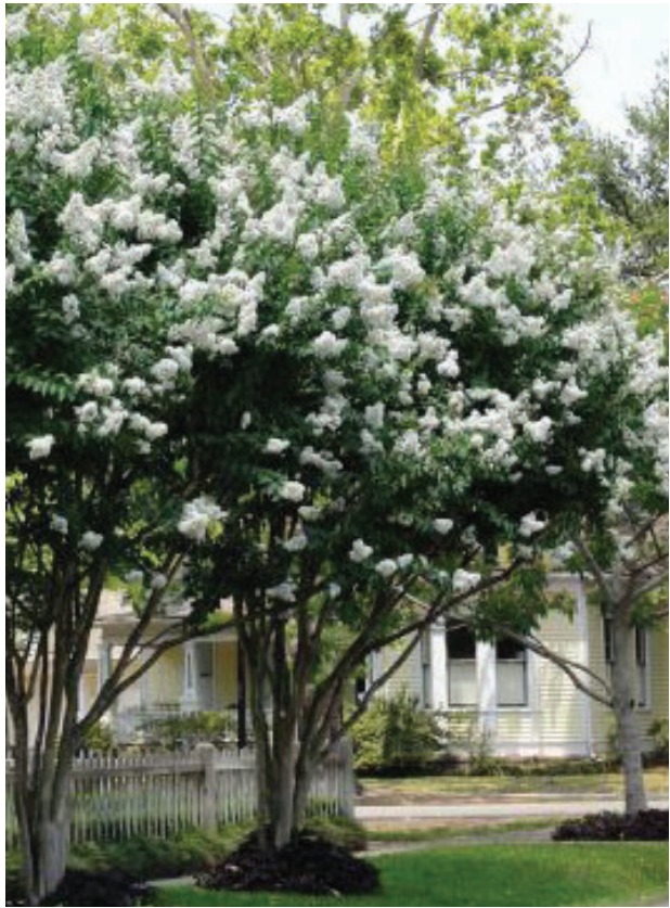
Building 2 Lagerstroemia indica x fauriei 'Natchez'