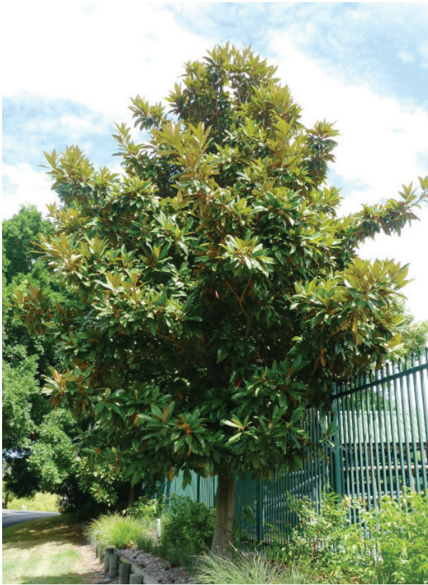
Building 1 Magnolia grandiflora 'Exmouth'