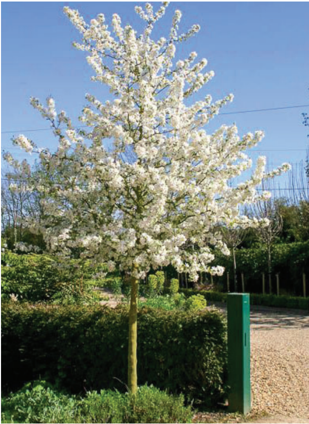
Building 3 Pyrus calleryana 'Chanticleer'