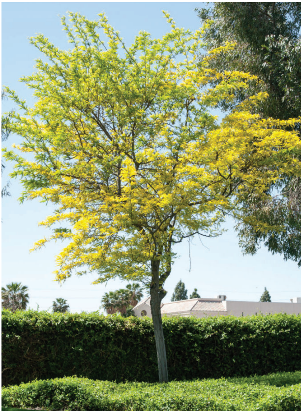
Building 4 Gleditsia triacanthos var. inermis 'Sunburst'